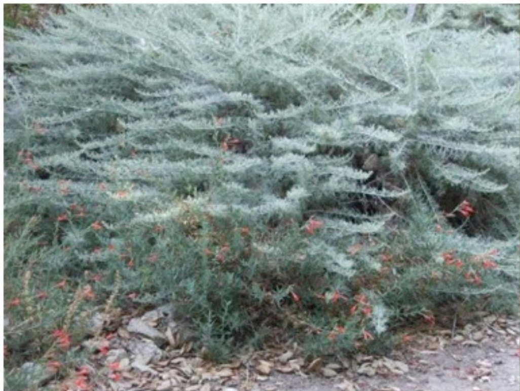
Artemisia californica 'Montara' ~ California Sagebrush 1.5-5'tall x 4-7' wide