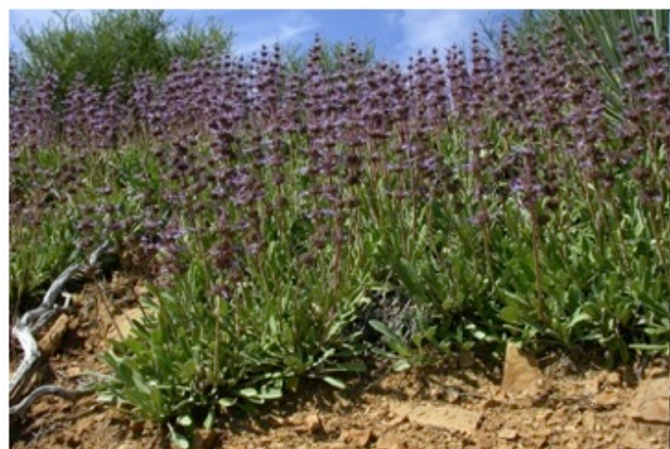
Salvia sonomensis - Sonoma Sage