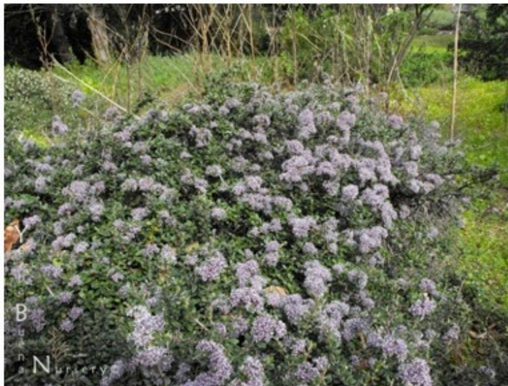
Ceanothus maritimus 'Point Sierra'