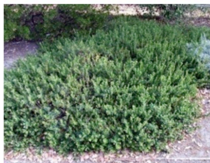
Arctostaphylos edmundsii ~ Carmel Sur Manzanita 1'x12'