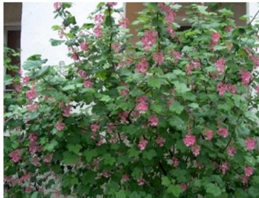
Calycanthus occidentalis – Spice Bush 4'x4'